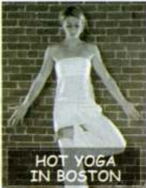
HOT YOGA IN BOSTON